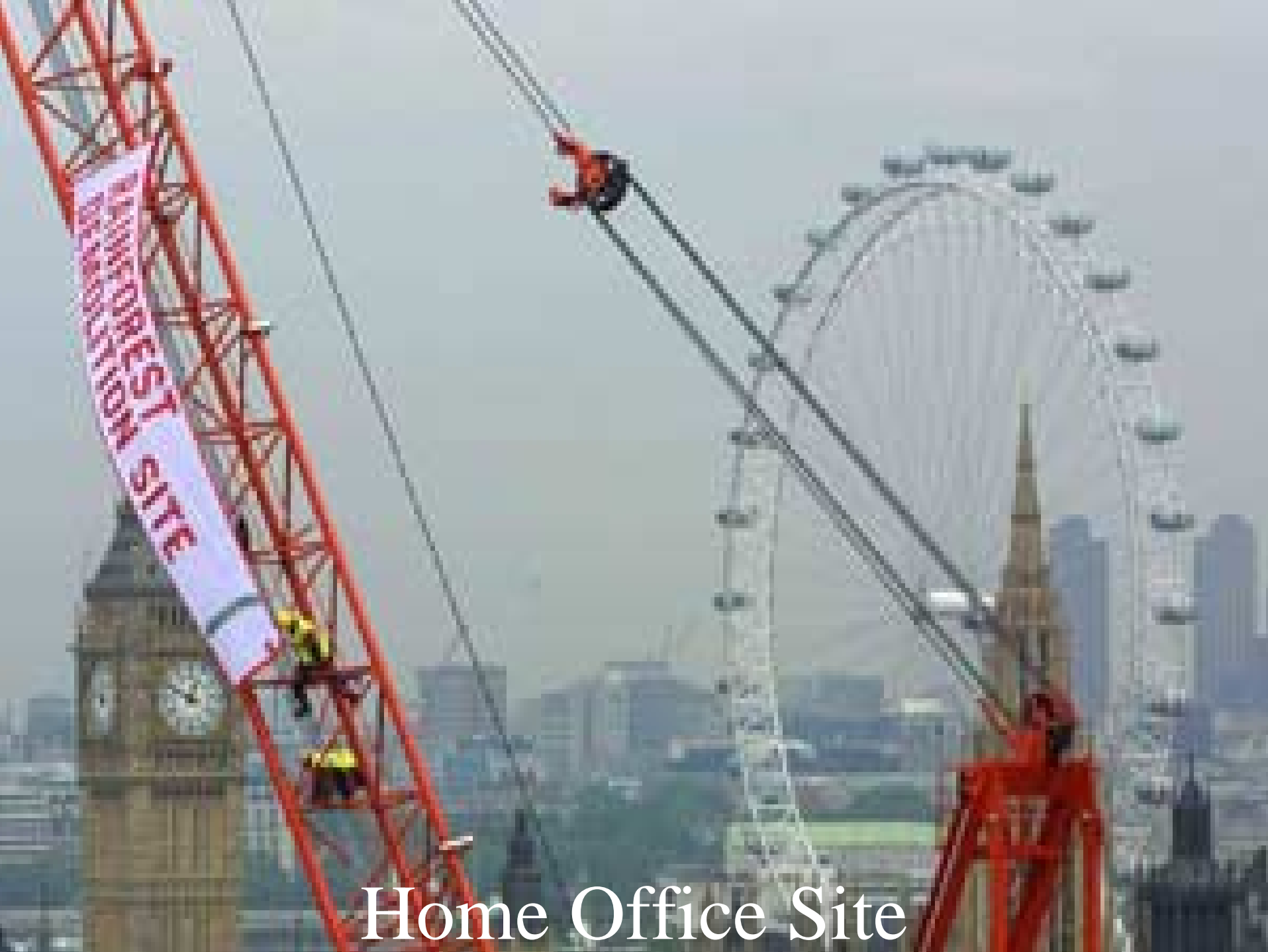
Home Office Site